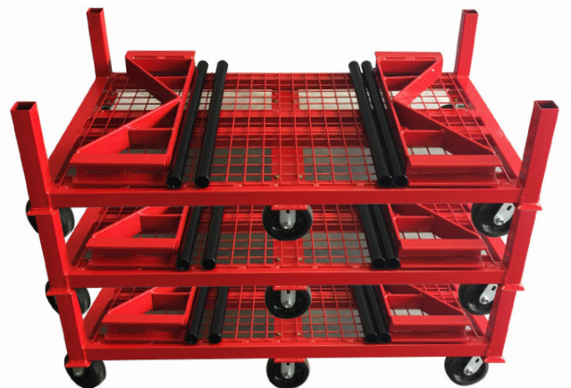
PART NO 2015-6F - Folds and stacks