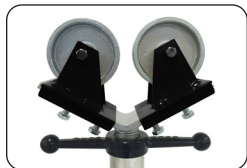
90060 - Steel wheel head