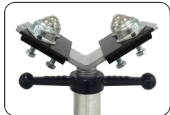
90000 - Ball transfer head