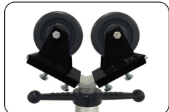
90032 - Phenolic wheel head